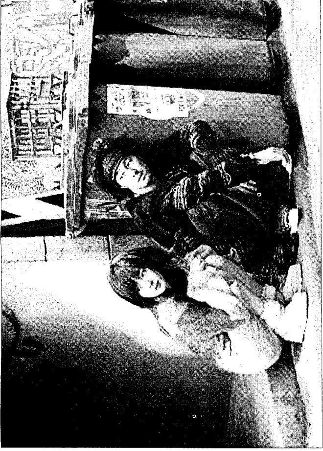
A scene from the 2004 hit drama "I Am Sorry, I Love You," featuring the character of overseas adoptee Mu-hyuk, right. So Ji-sub plays Mu-hyuk, raised by an abusive family in Australia.

For example, in 2004, MBC produced the drama "Ireland" featuring an adopted Korean woman Jung-ah, played by Lee Na-young, who grows up in an Irish-American family. However, when the family moves back to Ireland, her adoptive brother becomes involved in the Irish Republican Army and her adoptive par-